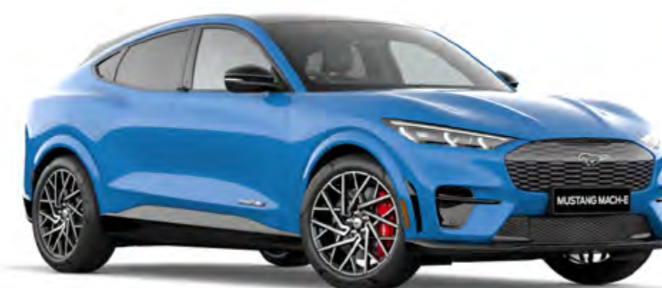
Grabber Blue Metallic*