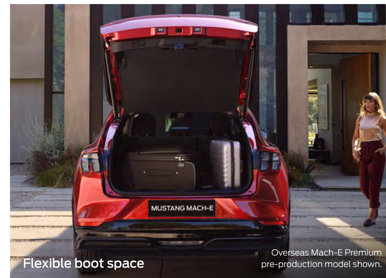
Flexible boot space

Overseas Mach-E GT pre-production model shown.