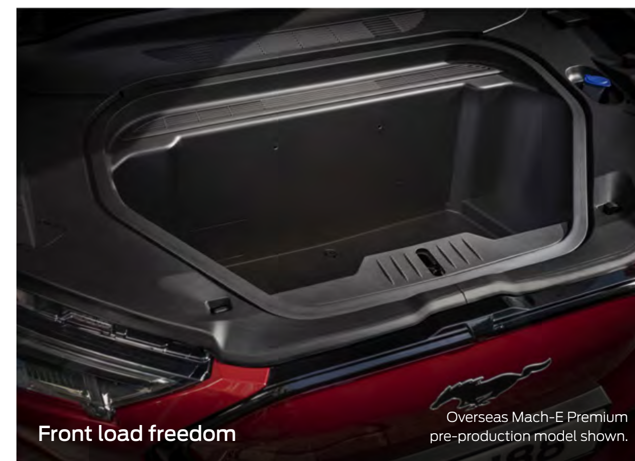
Front load freedom

Overseas Mach-E GT pre-production model shown.