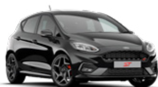
Agate Black Metallic*