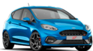
Ford Performance Blue*