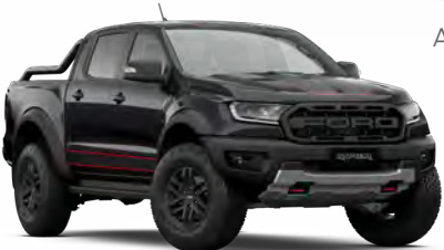
Shadow Black 2