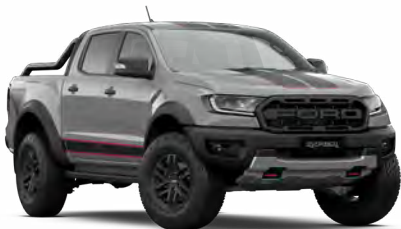
Conquer Grey 2