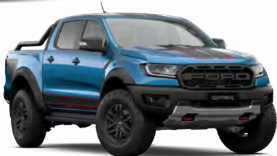
Ford Performance Blue 2